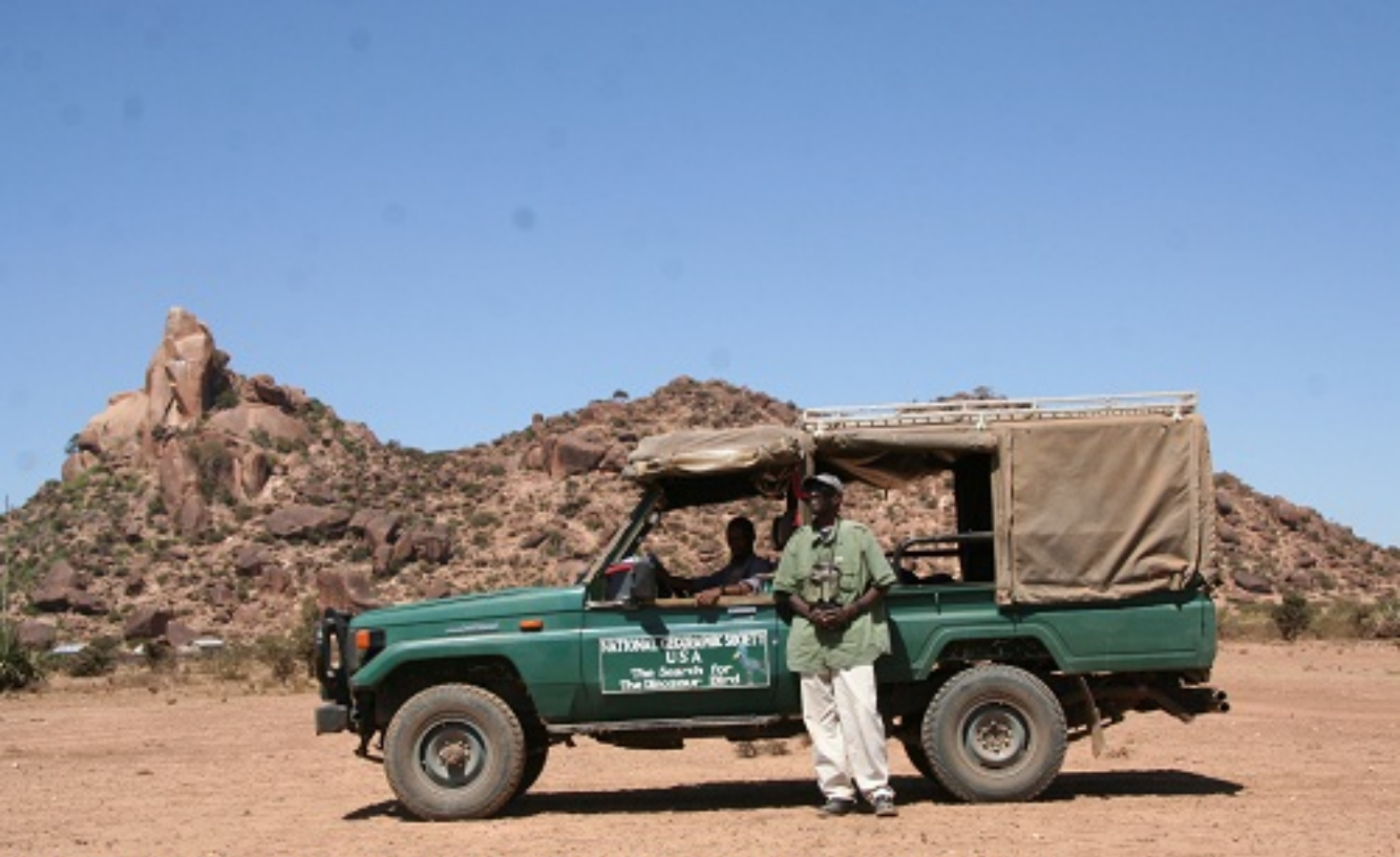
Surveying Bustards in Jumfo-Uurey hills area.