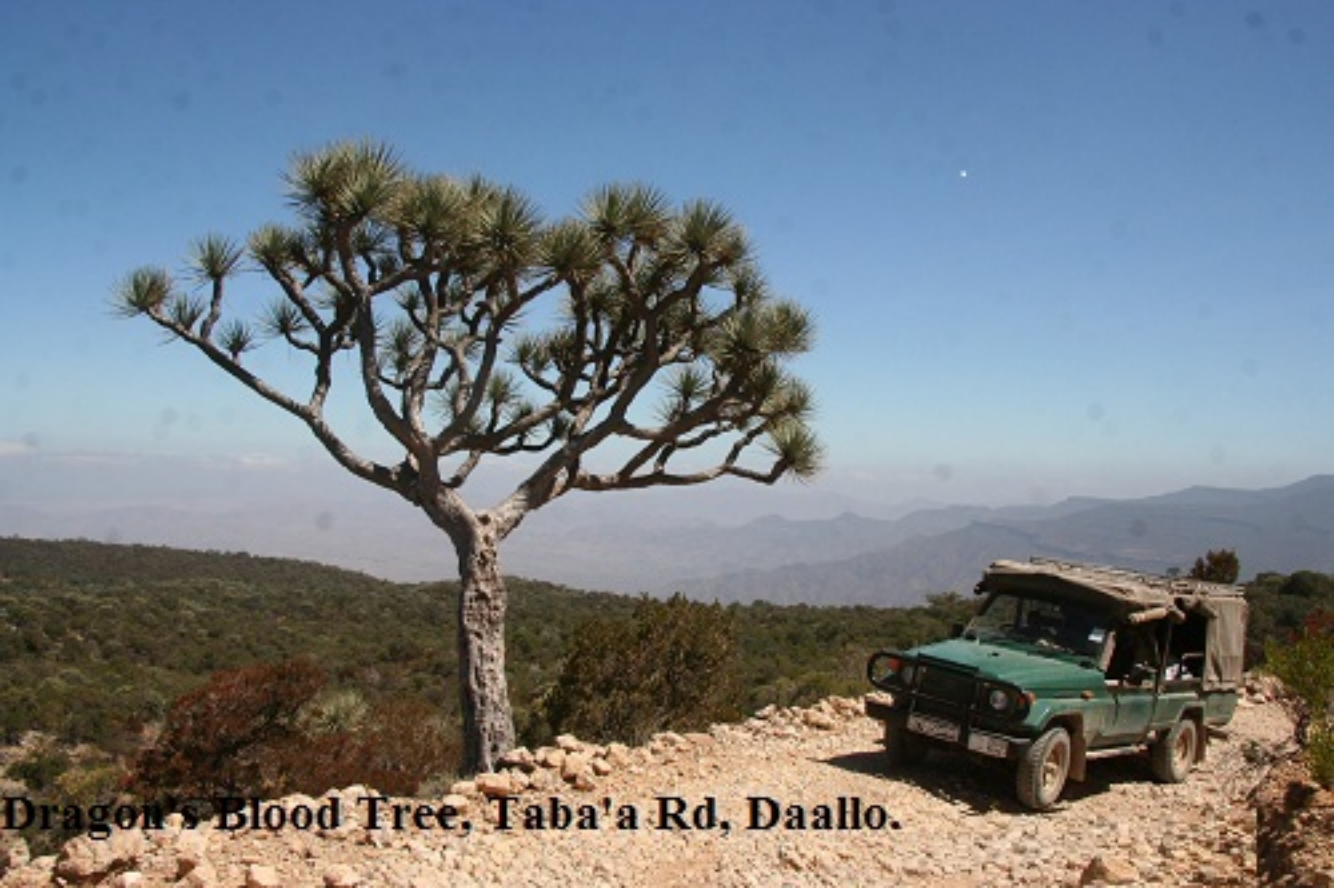
Dragon's Blood Tree, Taba'a Rd, Daallo.