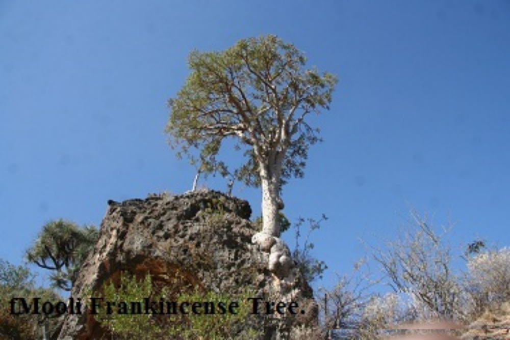
Mooli Frankincense Tree.