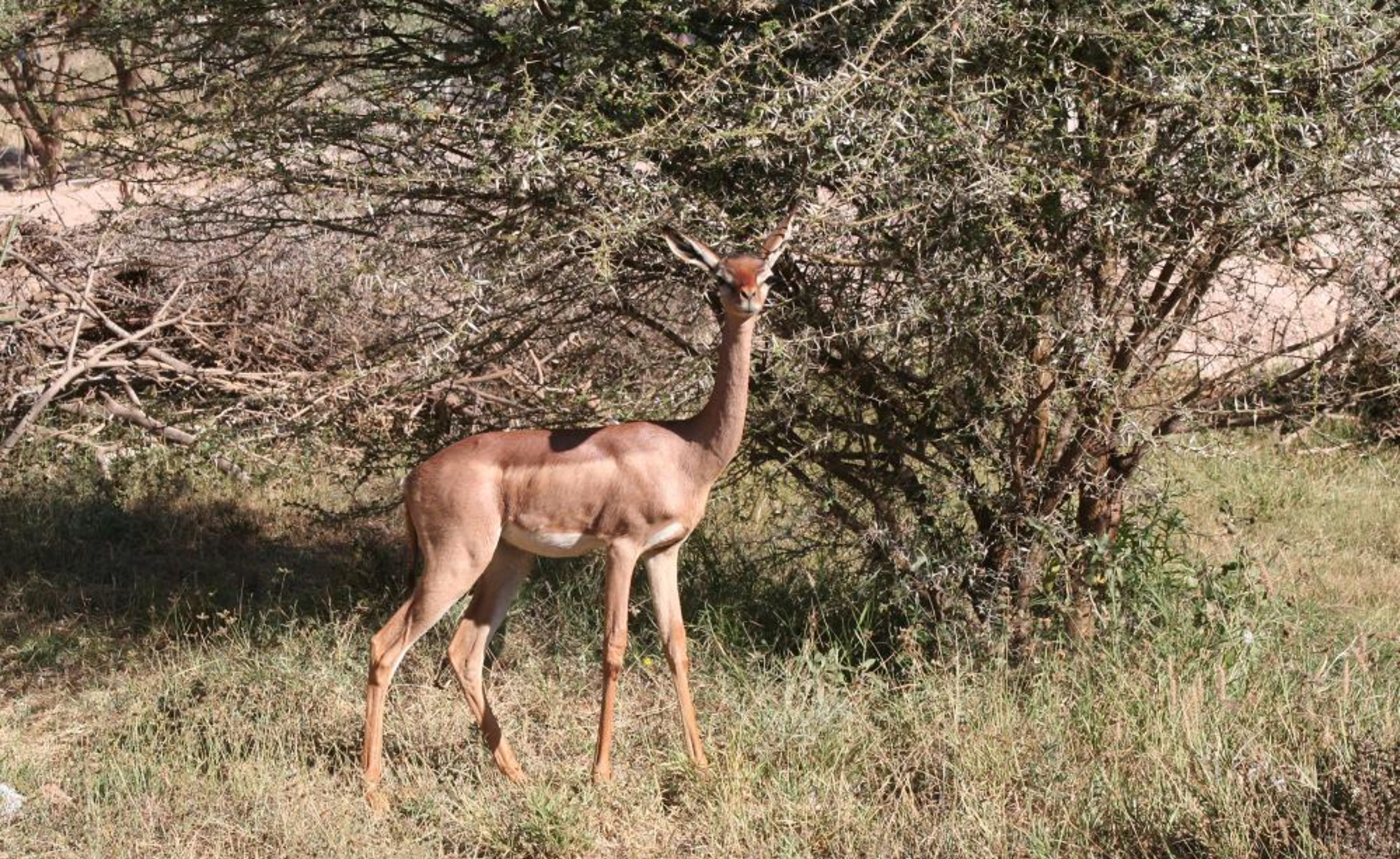
Sub-adult Gerenuk ewe.