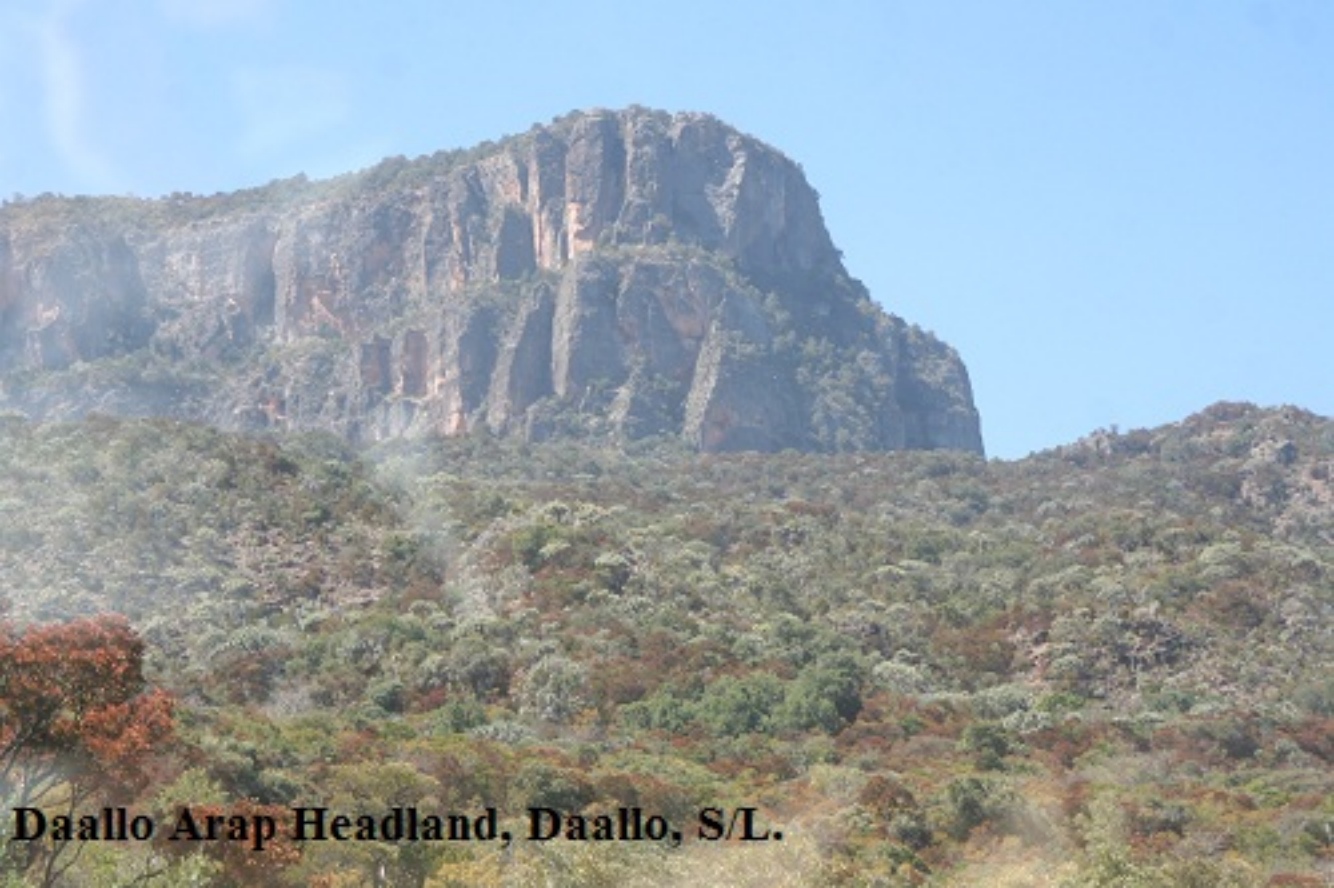
Daallo Arap Headland, Daallo, S/L.