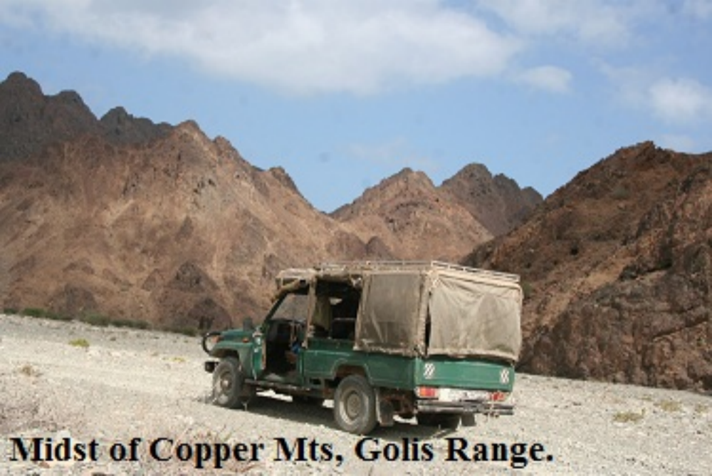
Midst of Copper Mts, Golis Range.