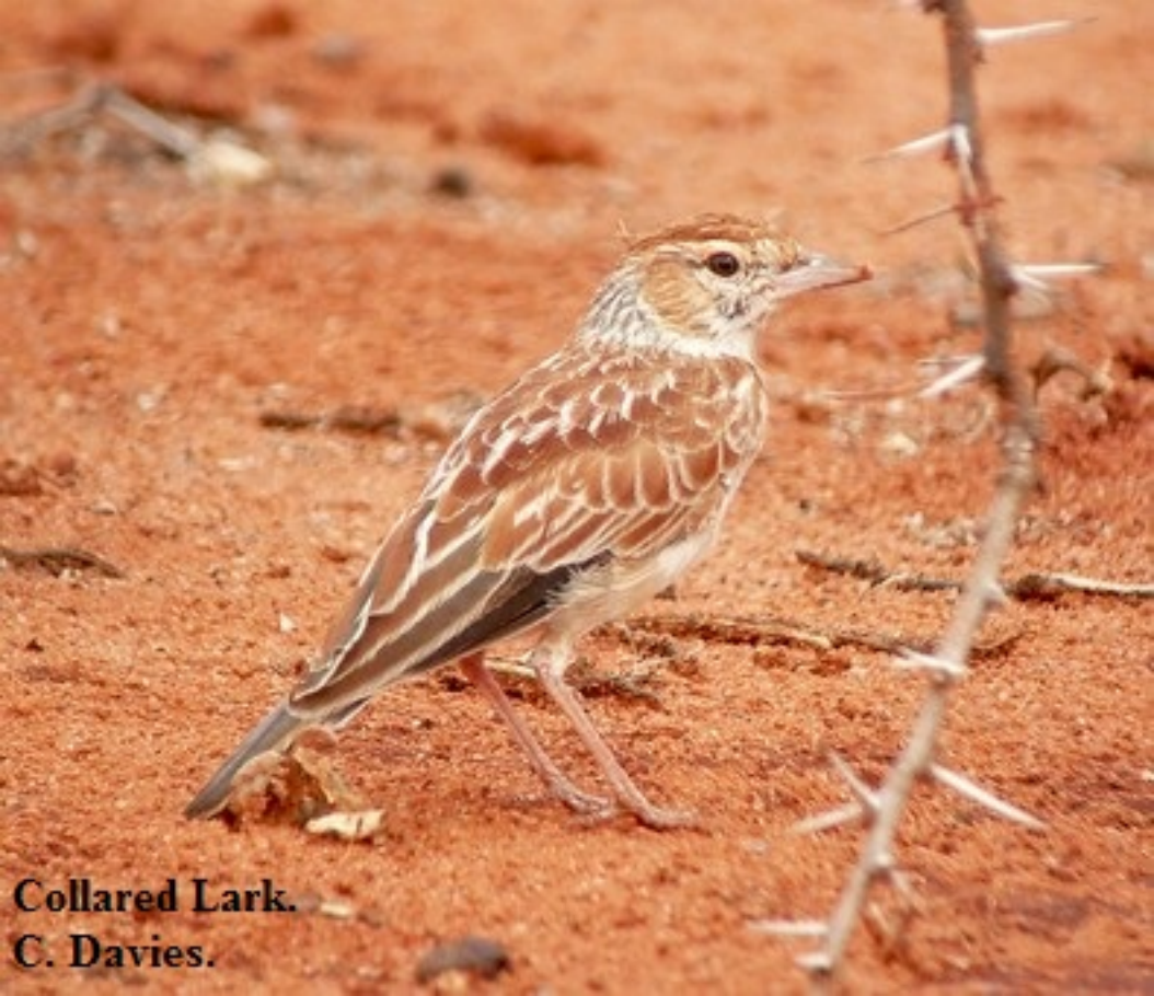
Collared Lark.