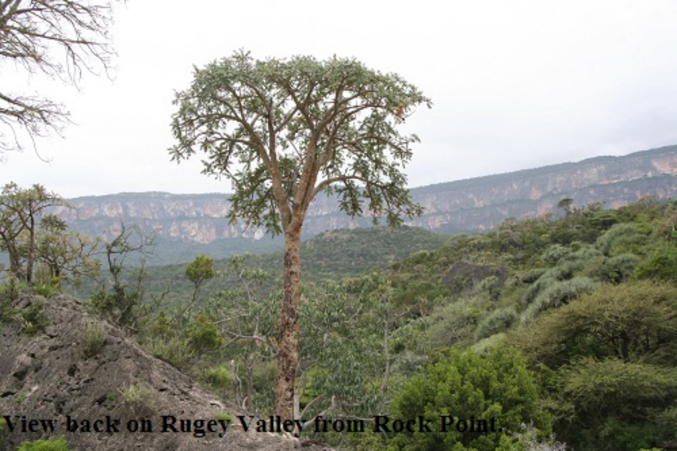
View back on Rugey Valley from Rock Point.