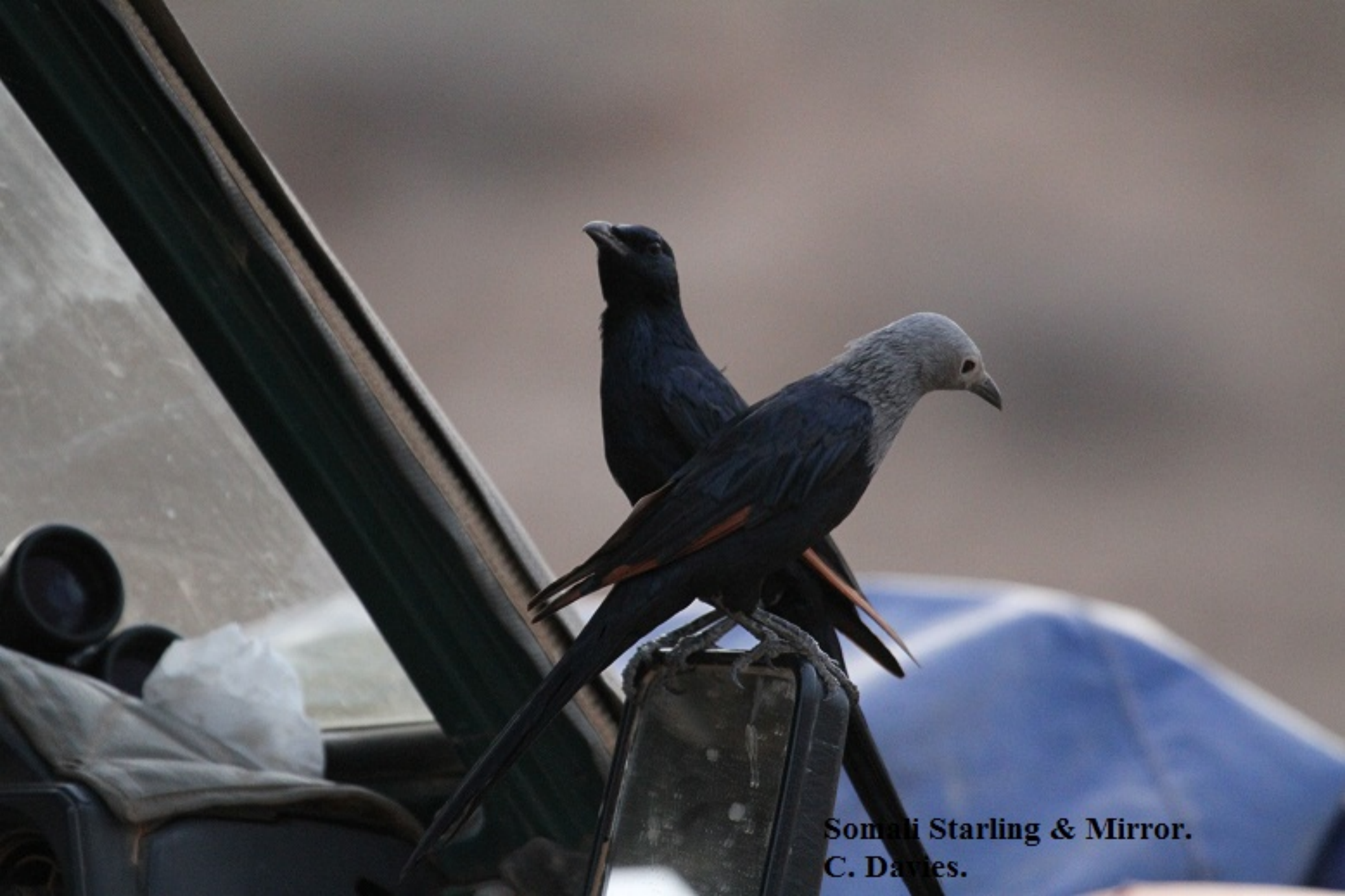
Somali Starling & Mirror.