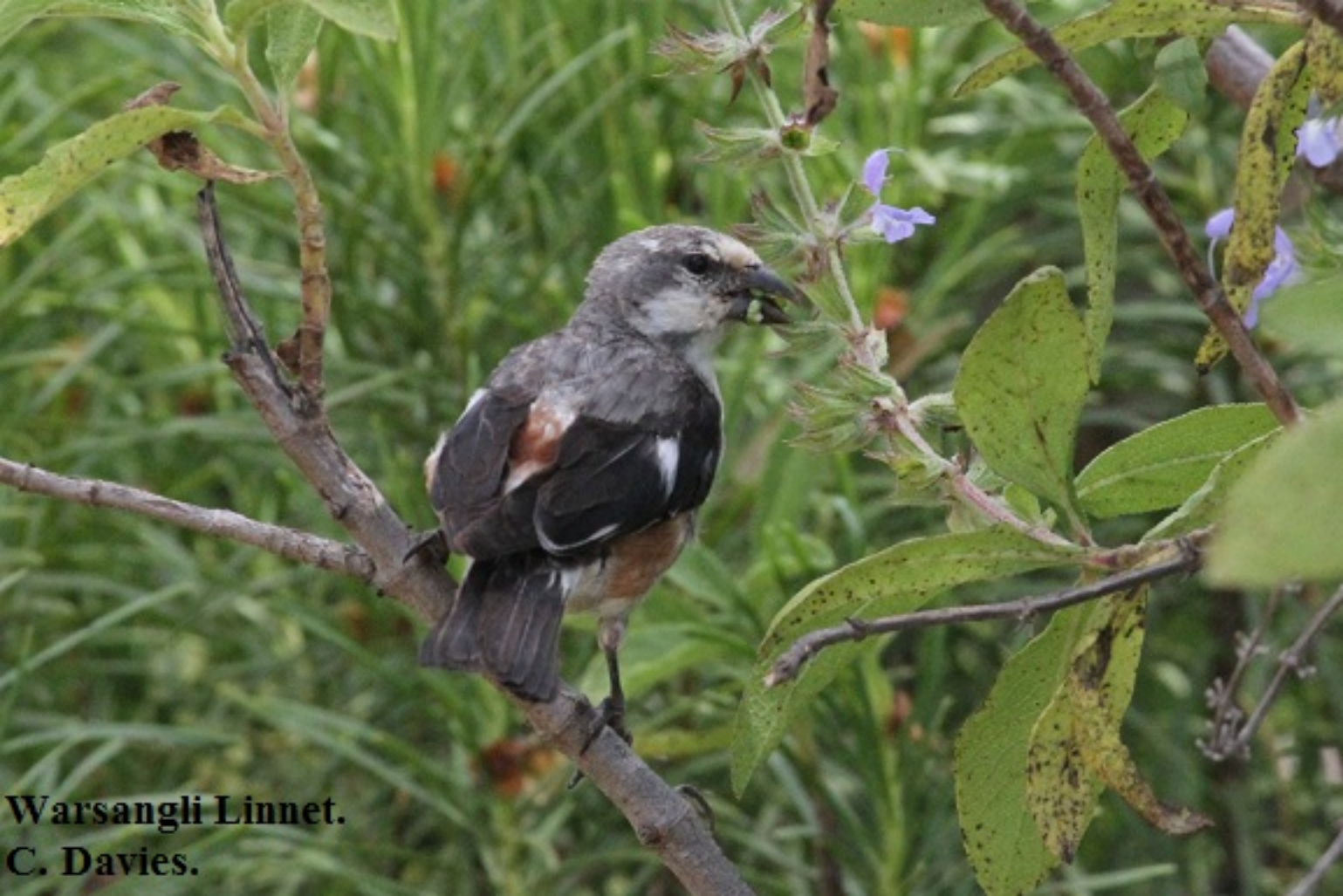
Warsangli Linnet.