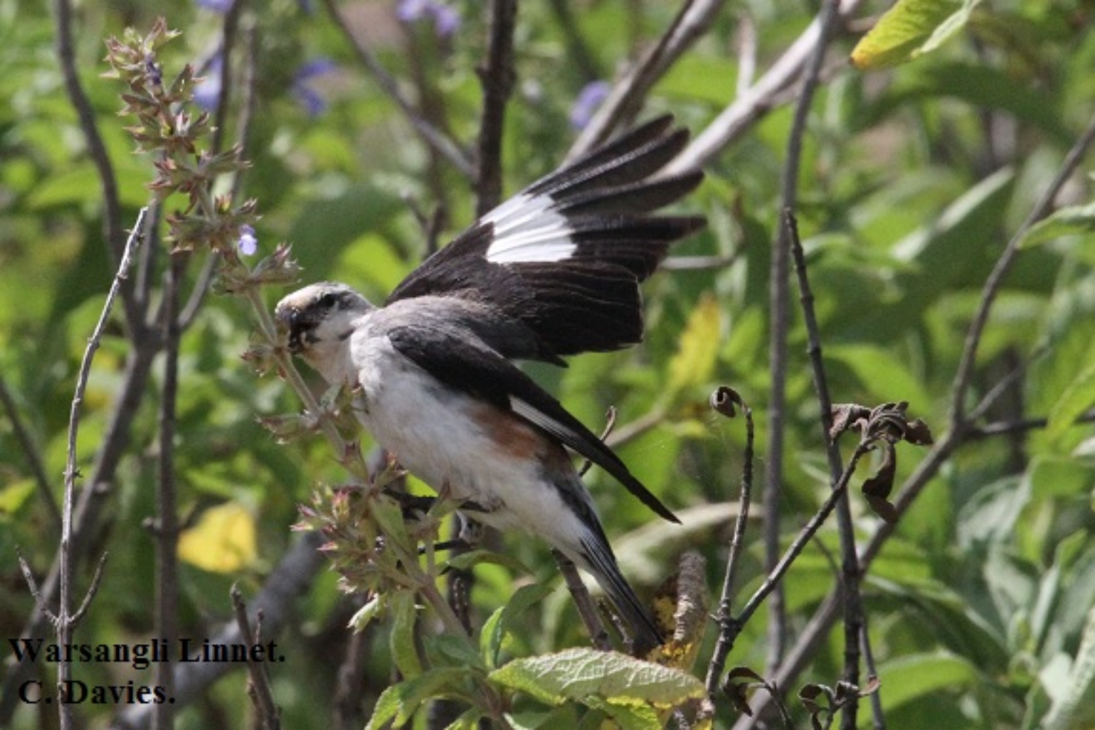
Warsangli Linnet.