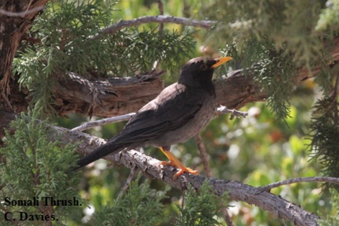
Somali Thrush.